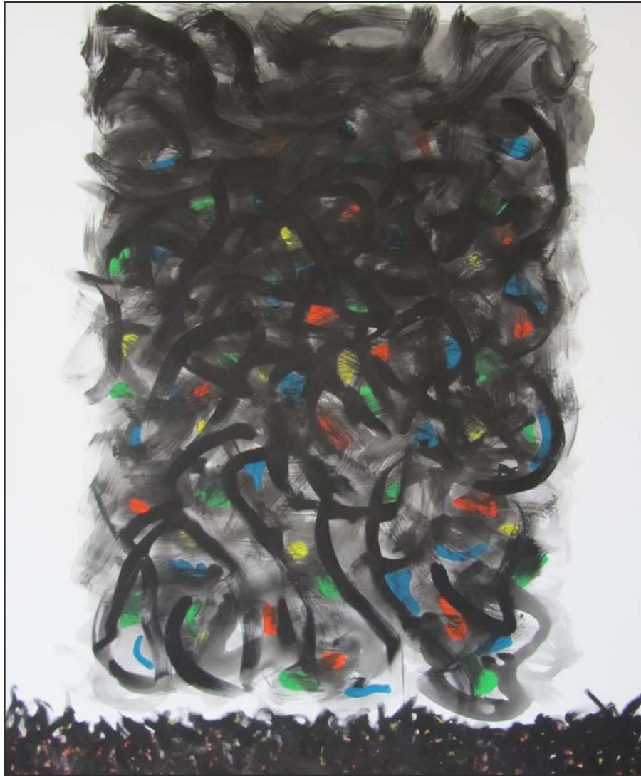
Iron Trove 2017 72" x 60" Acrylic on Canvas