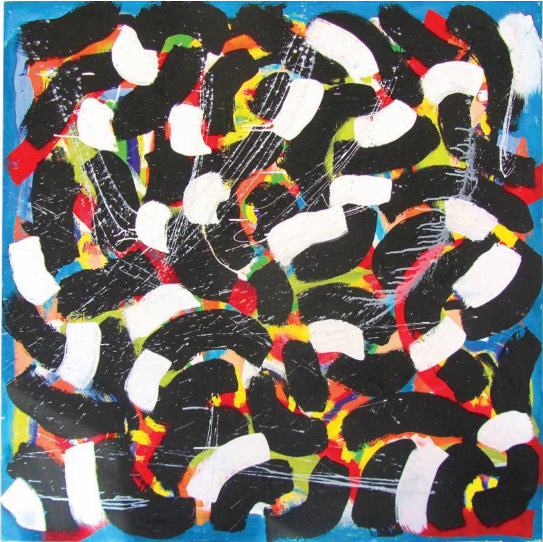
Song in Black and White 2016 30" x 40" Acrylic on Canvas