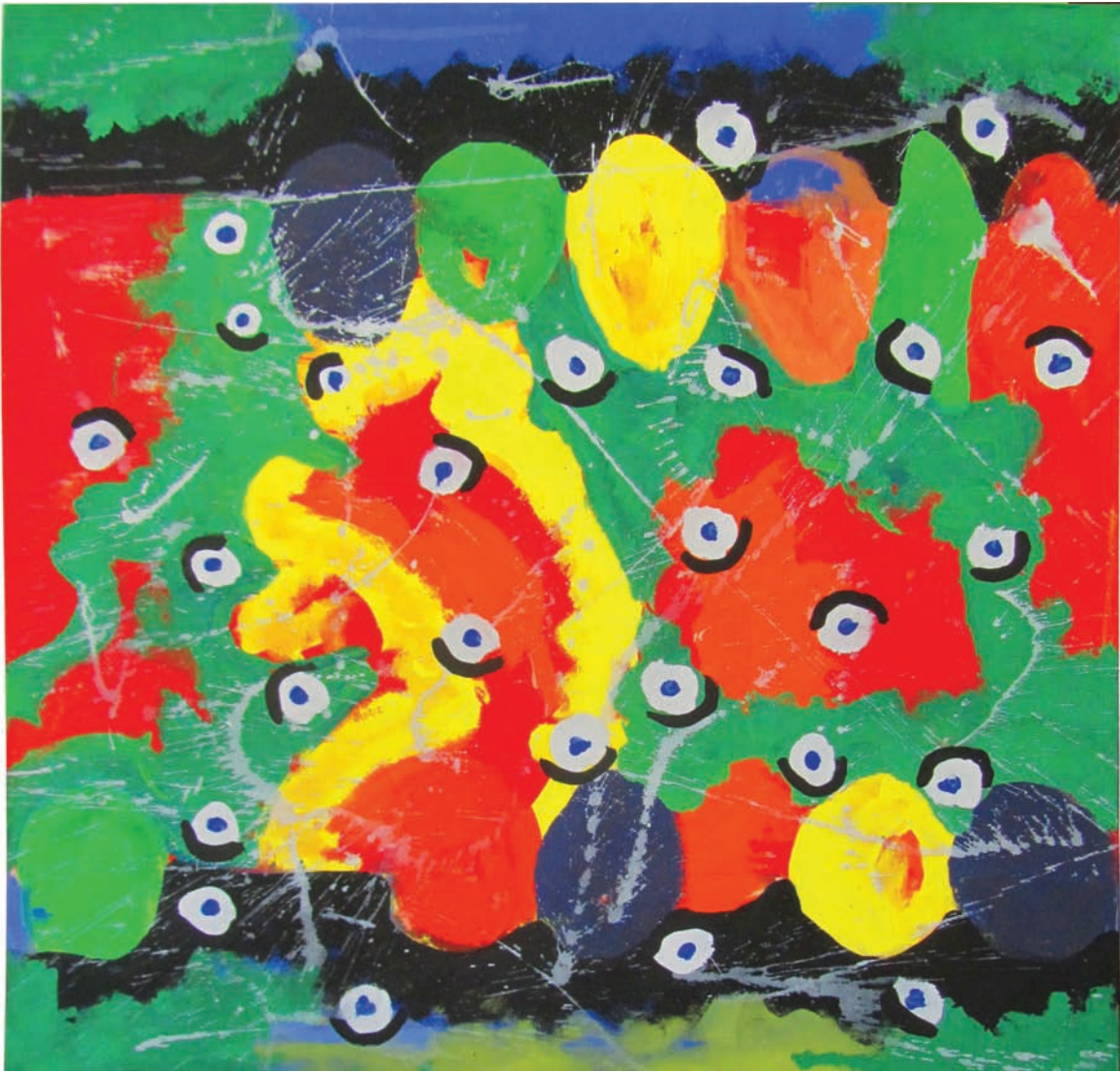
Fairway Dreams 2016 48" x 48" Acrylic on Canvas