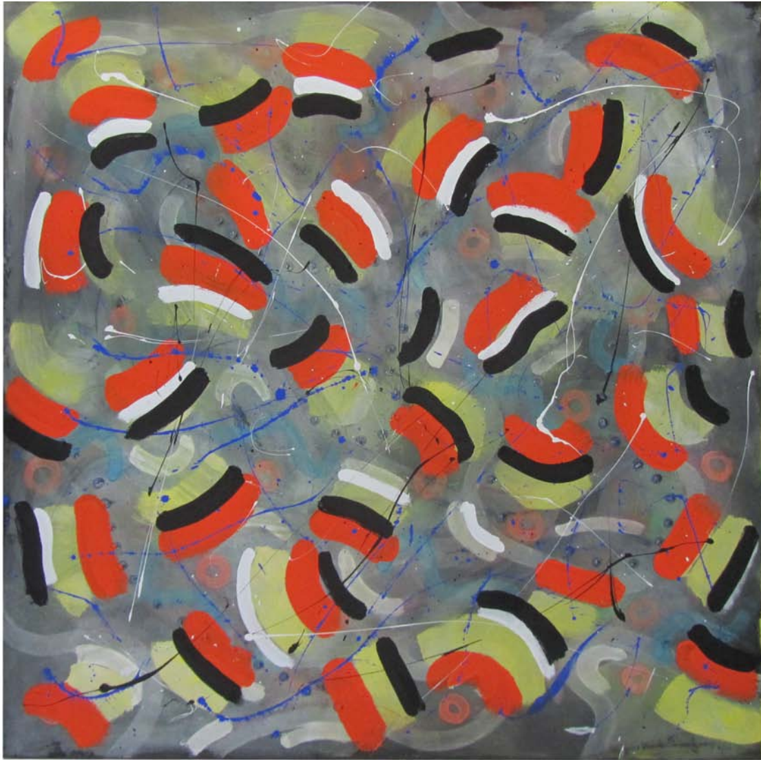
Watermelon Love 2016 48" x 48" Acrylic on Canvas