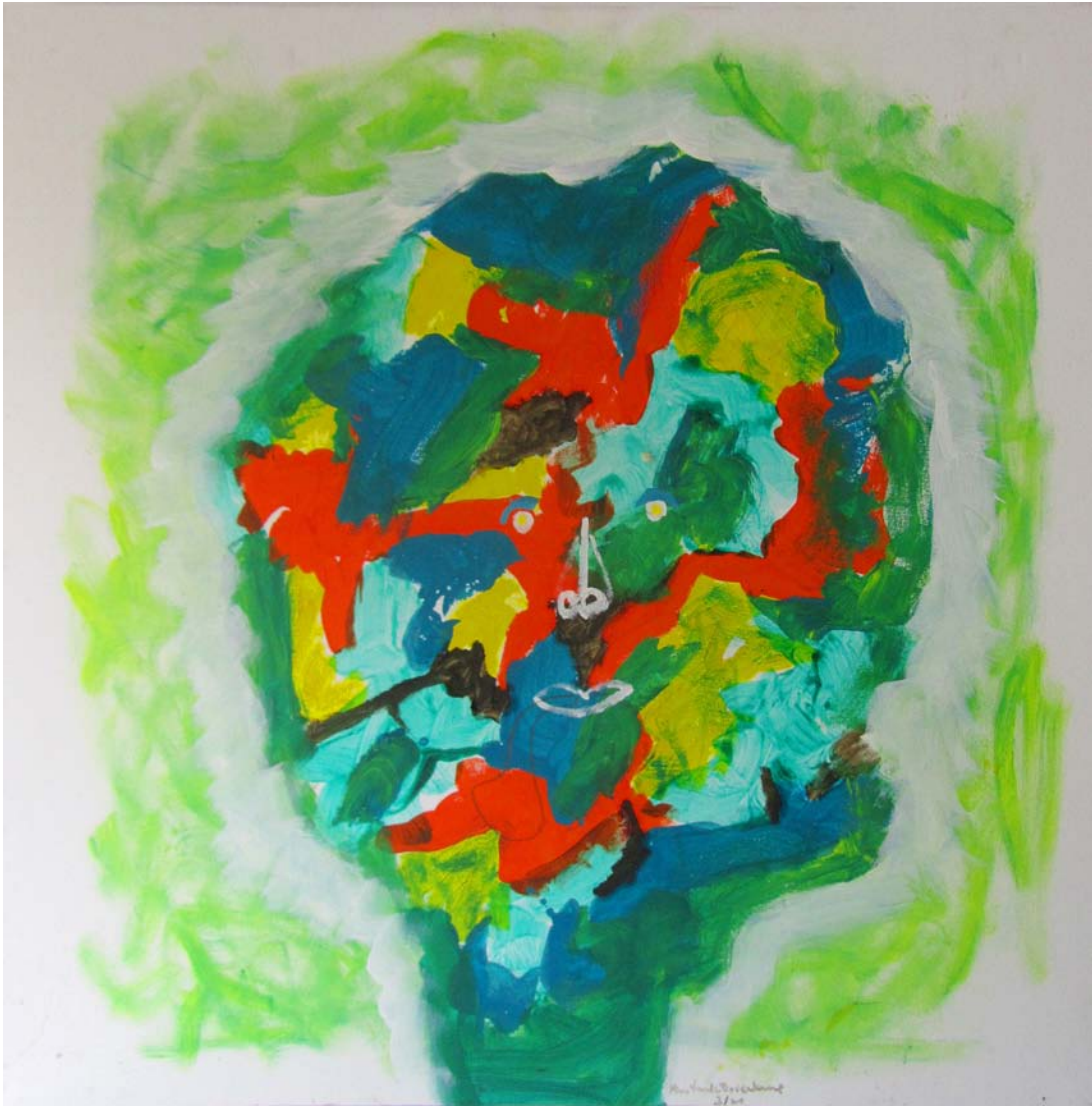
Mr Pickle 2020 36" x 36" Acrylic on Canvas