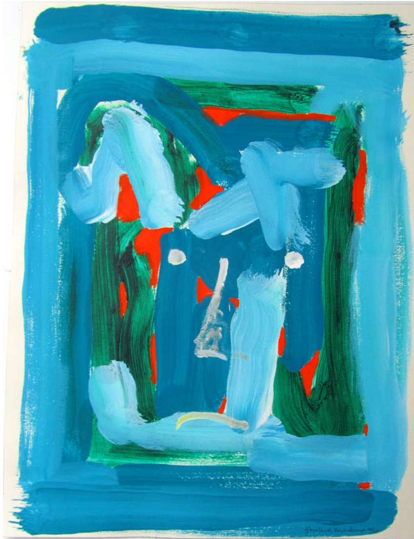
Bluebirds 2020 24" x 18" Acrylic and Wash on Paper