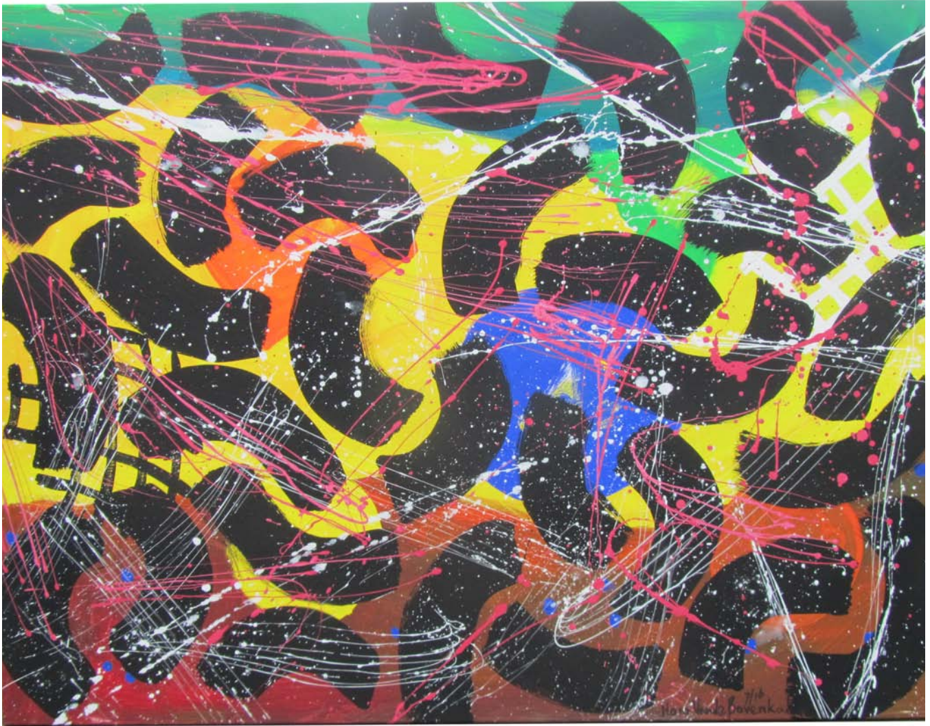
Summer Song 2016 30" x 40" Acrylic on Canvas