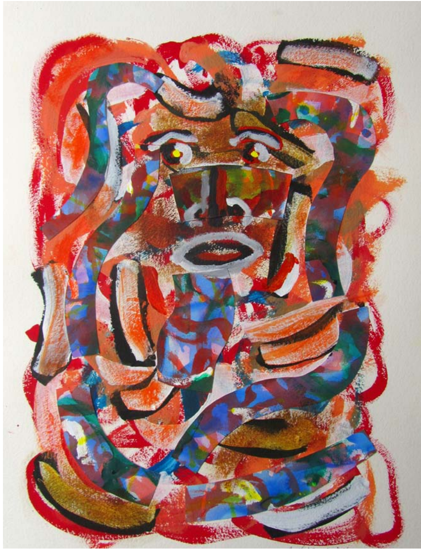
Rasta Man 2020 30" x 22" Acrylic and Collage on Paper