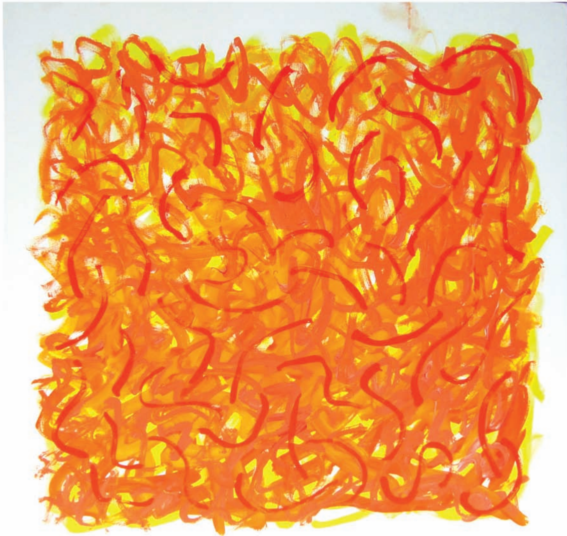
Summer Folly 2017 36" x 36" Acrylic on Canvas