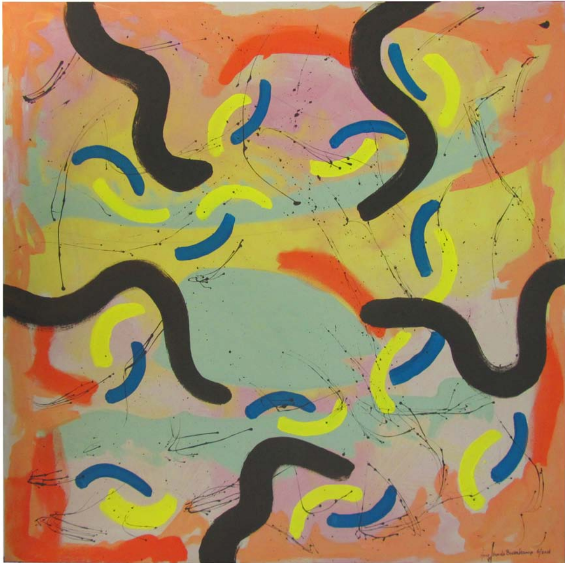
Serpentine 2016 48" x 48" Acrylic on Canvas