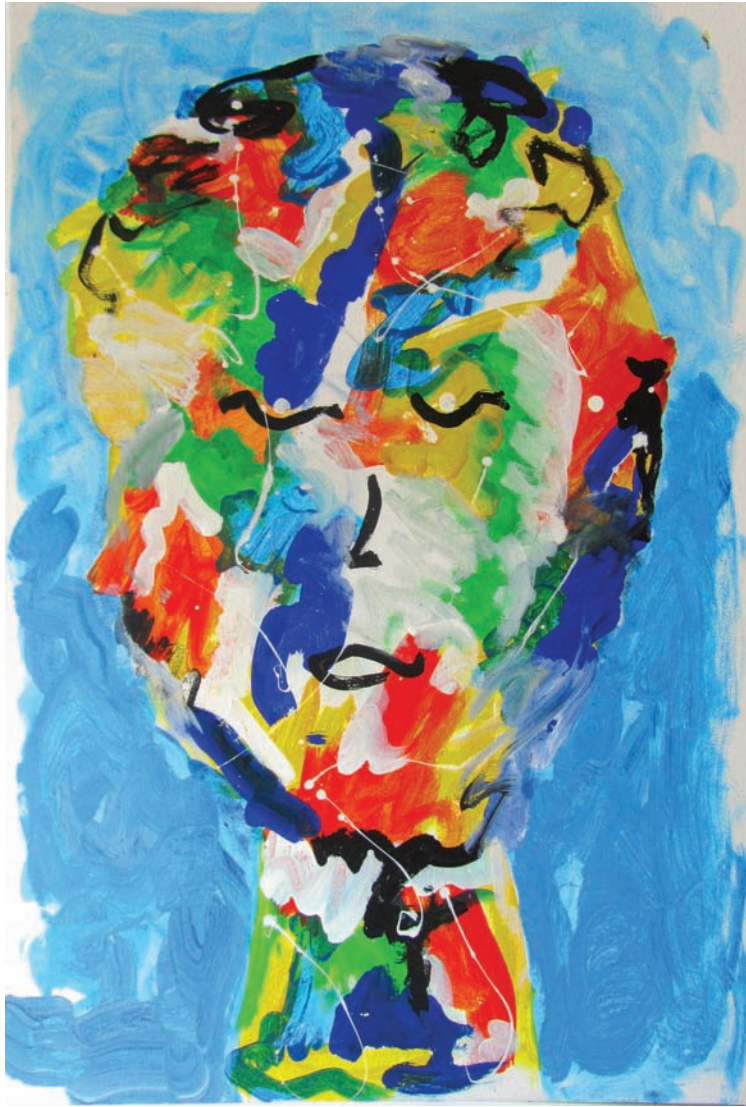
Mr Debonaire 2021 39" x 24" Acrylic and Wash on Paper