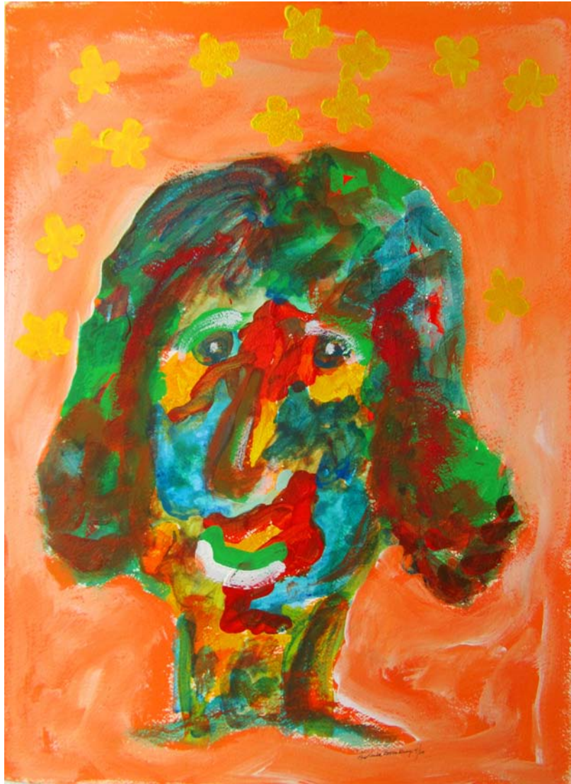
Aunt Silly 2020 30" x 24" Acrylic and Wash on Paper