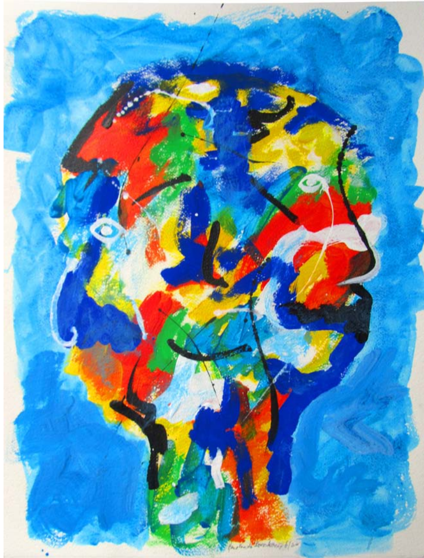
The Joy of Us 2021 30" x 22" Acrylic and Wash on Paper