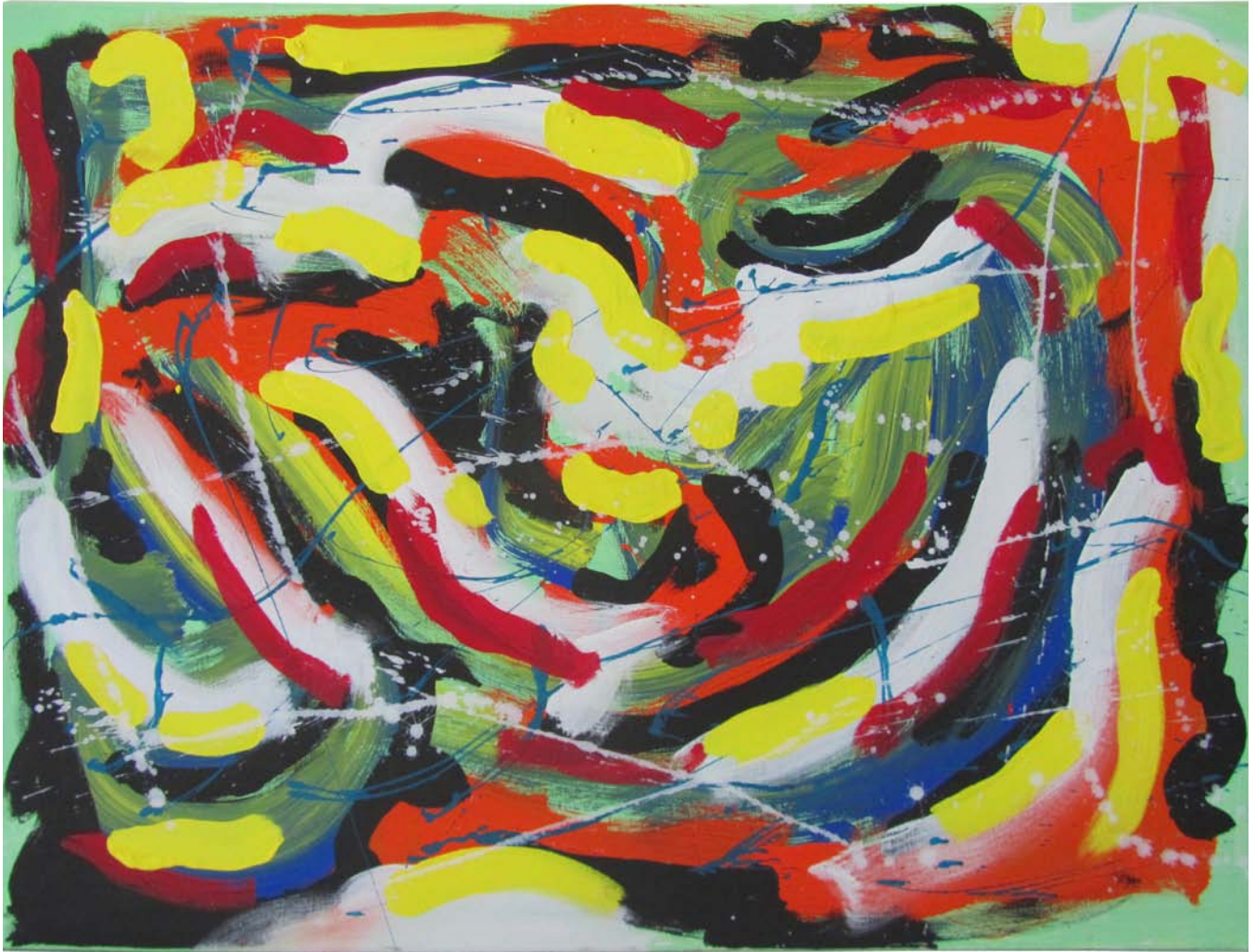
Rhythm Dancer 2016 30" x 40" Acrylic on Canvas