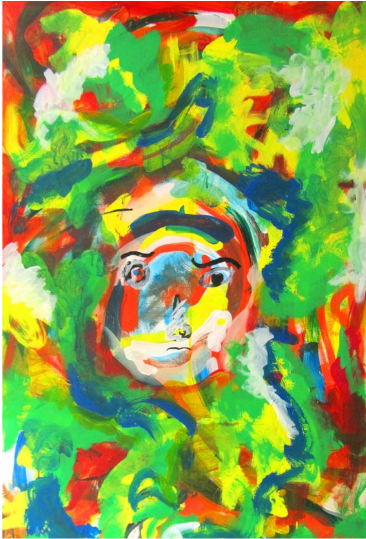
DeKooning 2020 60" x 36" Acrylic on Canvas