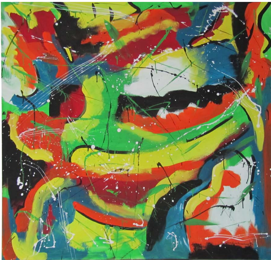
Music Wonder 2017 48" x 48" Acrylic on Canvas