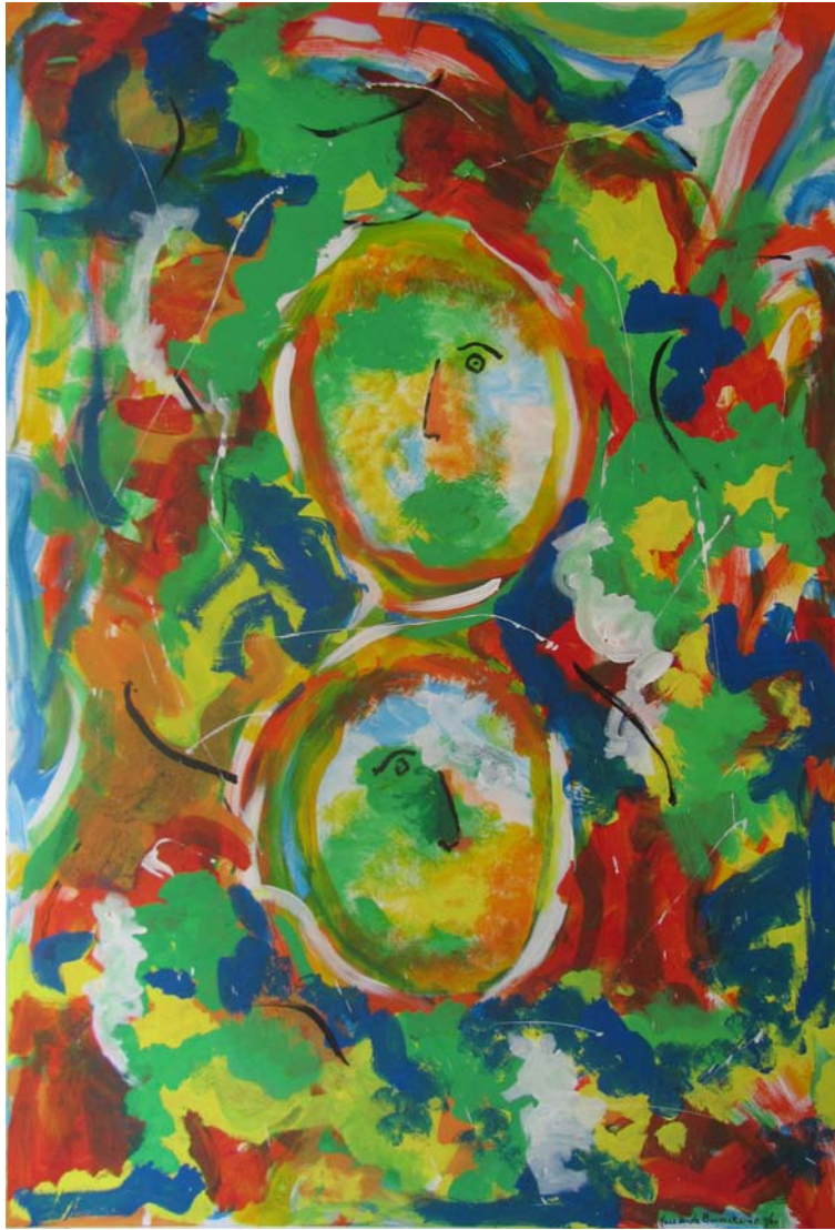
Double Moon 2020 72" x 48" Acrylic on Canvas