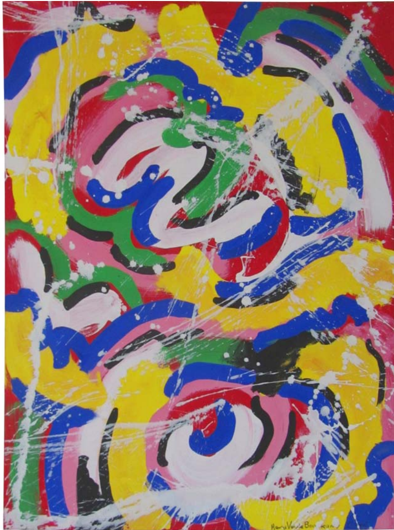
Color Bouquet 2016 40" x 30" Acrylic on Canvas