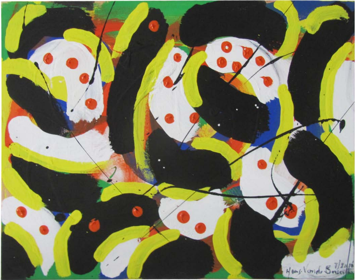
Panda Berries 2016 14" x 18" Acrylic on Canvas