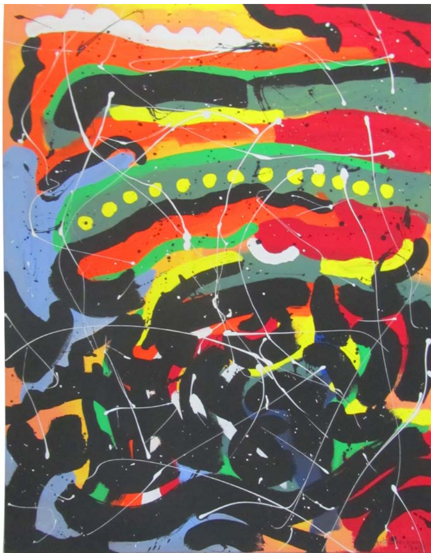
Embera Tribe 2016 40" x 30" Acrylic on Canvas