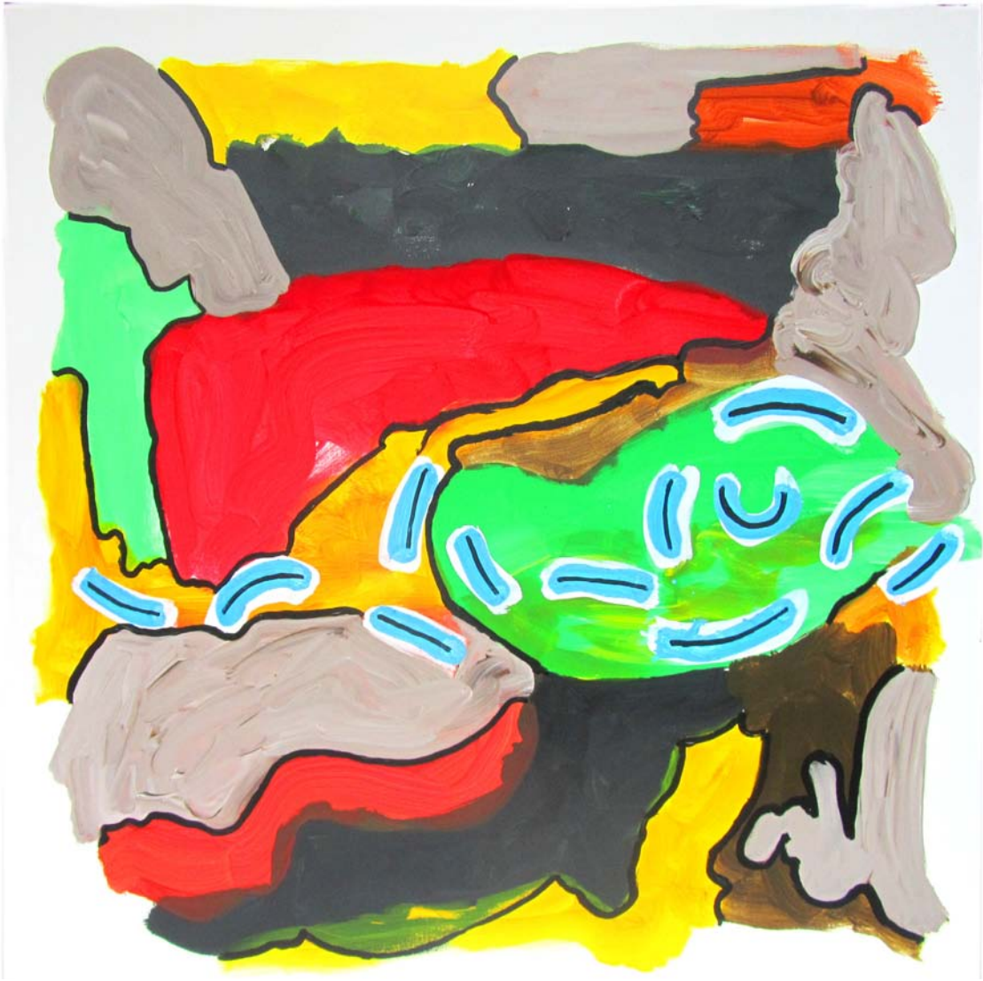
Vertical Landscape 2017 48" x 48" Acrylic on Canvas