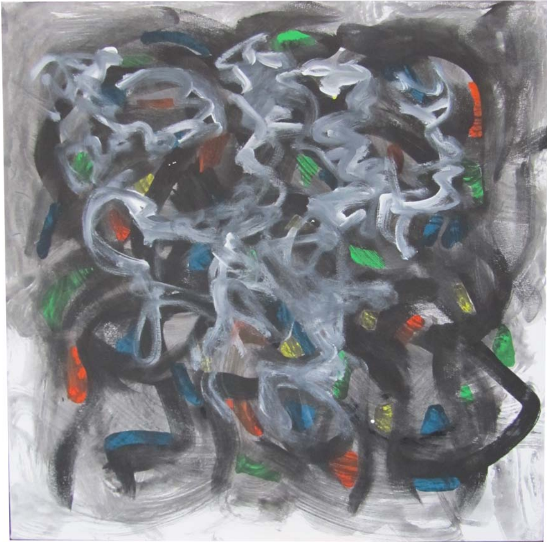
Wild Life Galore 2017 36" x 36" Acrylic on Canvas