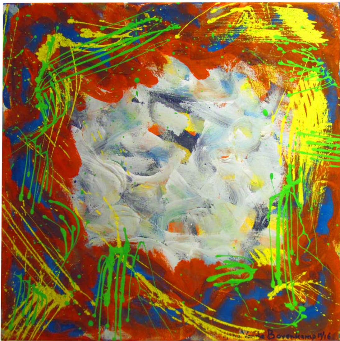
Ancestral Cloud 2016 16" x 16" Acrylic on Canvas