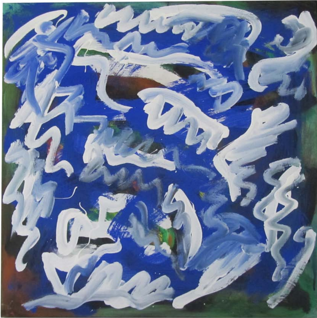
Riding Waves 2016 20" x 20" Acrylic on Canvas