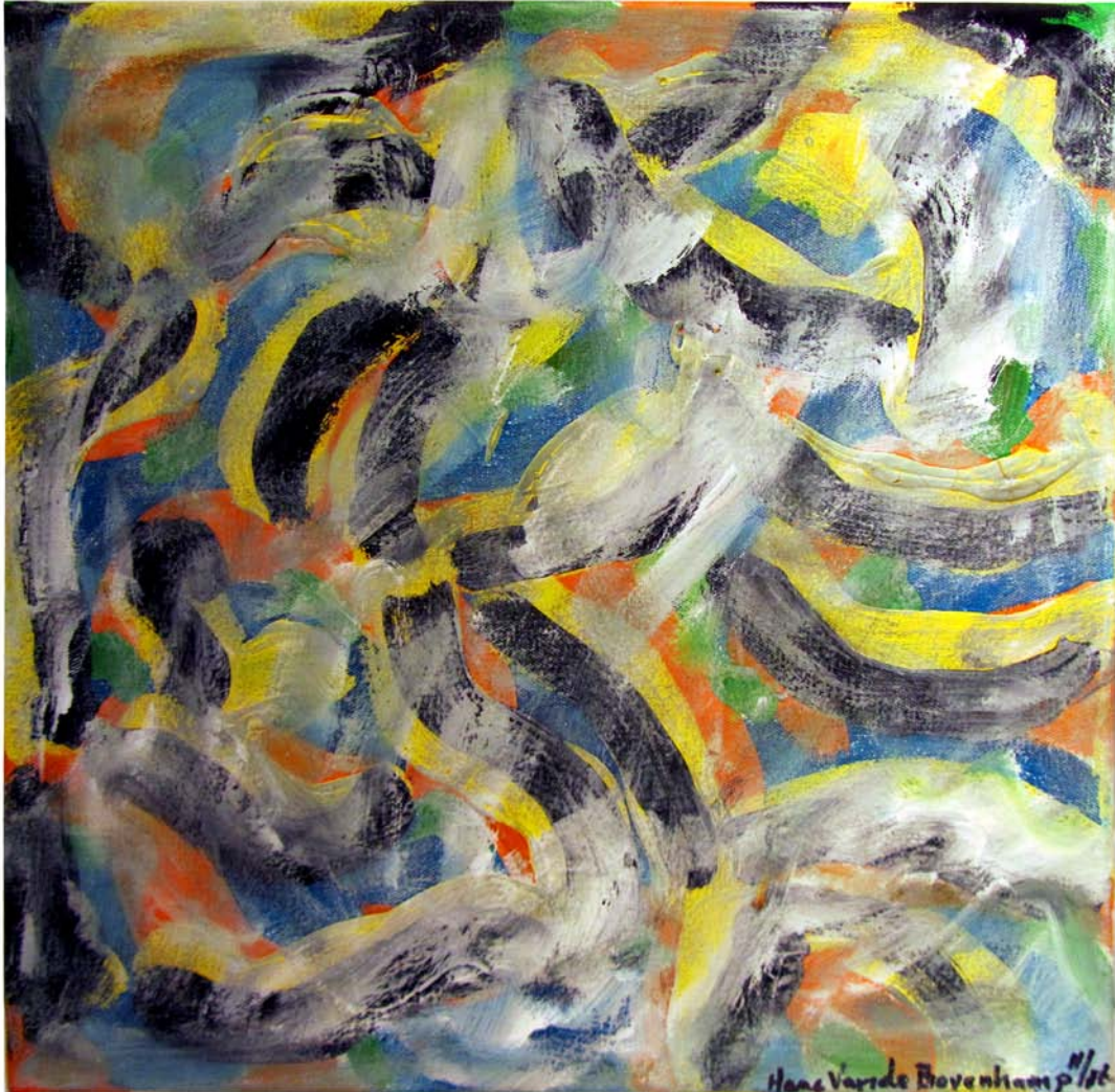
New Morning 2016 16" x 16" Acrylic on Canvas