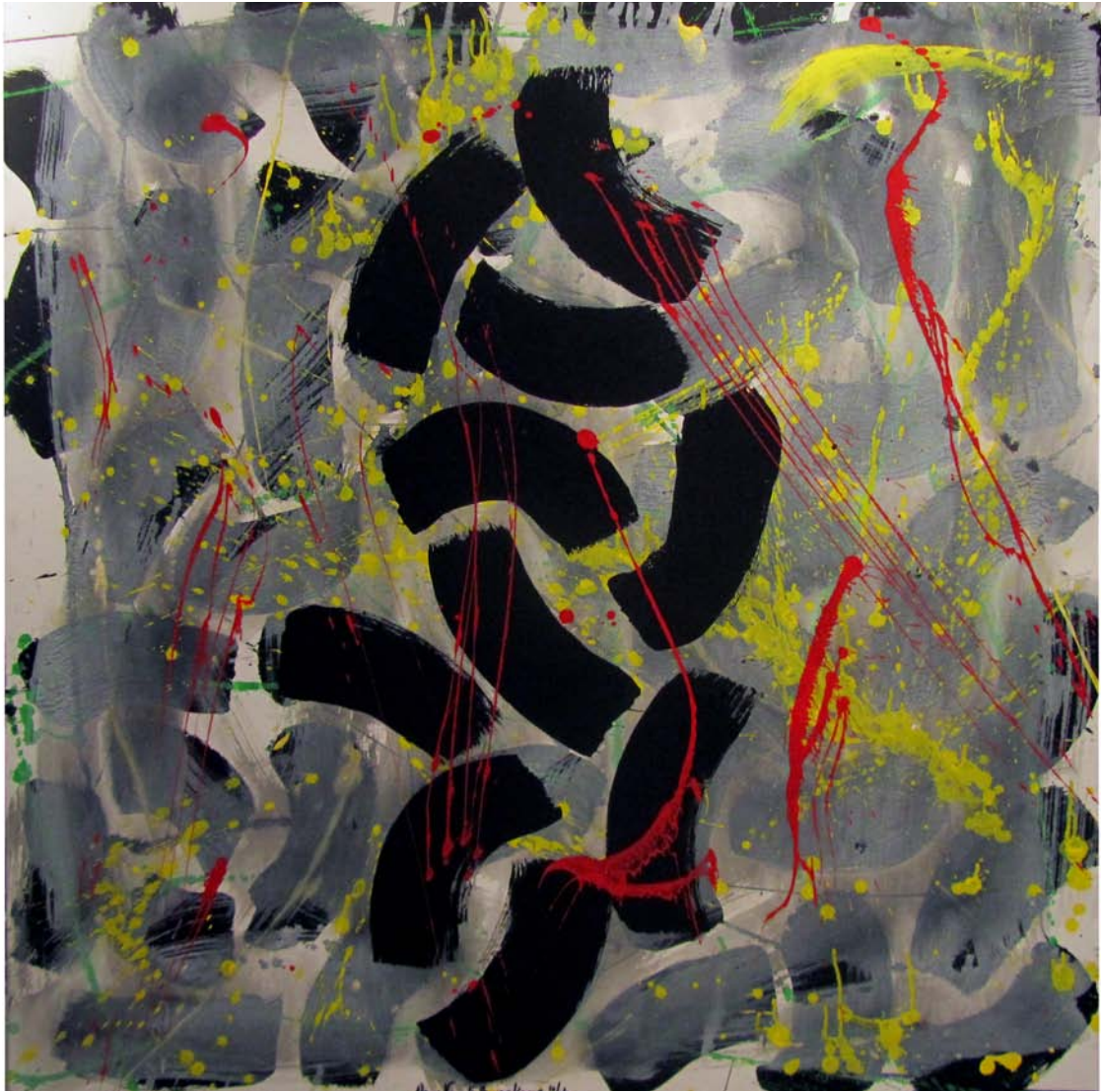
Ascending River 2016 36" x 36 " Acrylic on Canvas