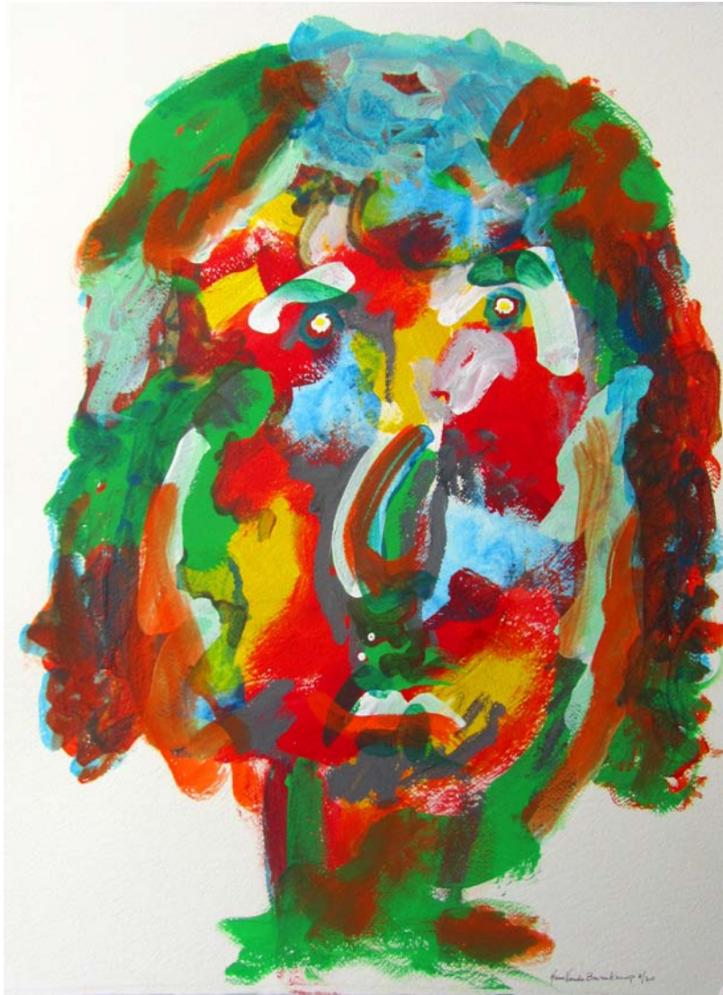
Golda 2020 30" x 24" Acrylic and Wash on Paper