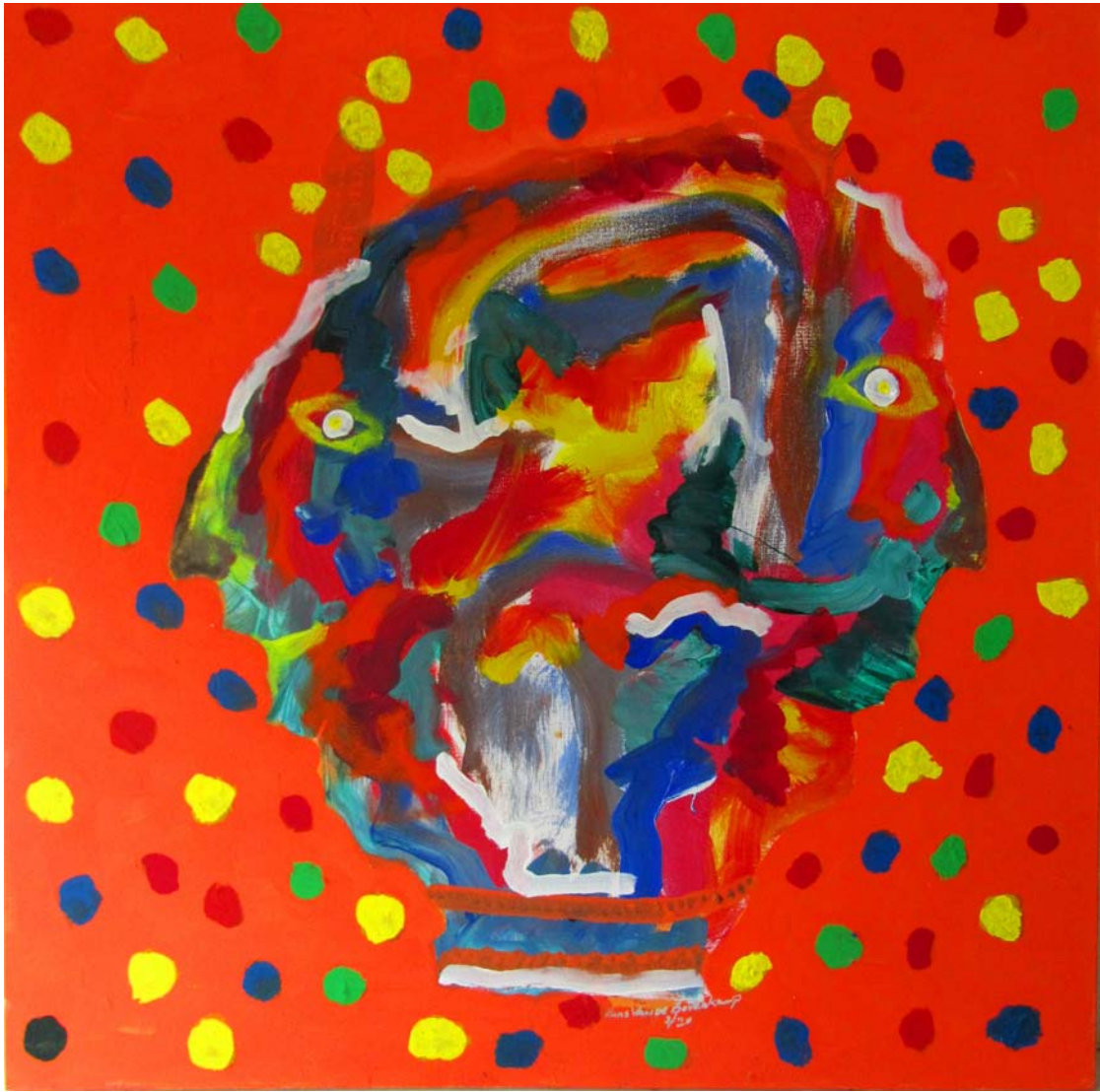
Western Culture 2020 36" x 36" Acrylic on Canvas