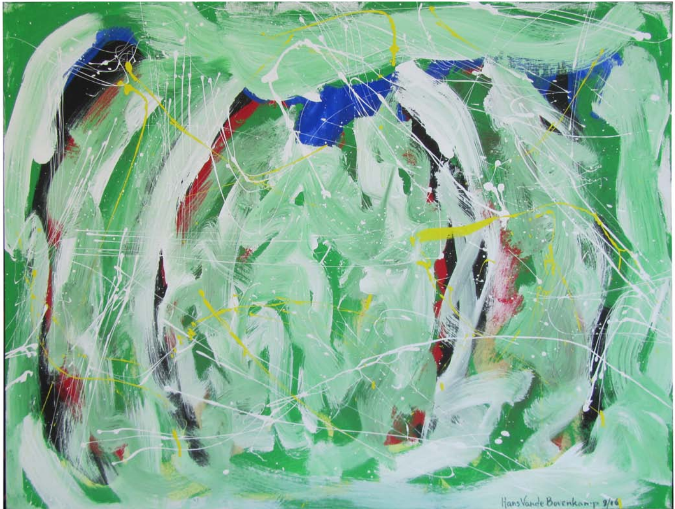
Green Dreams 2016 30" x 40" Acrylic on Canvas