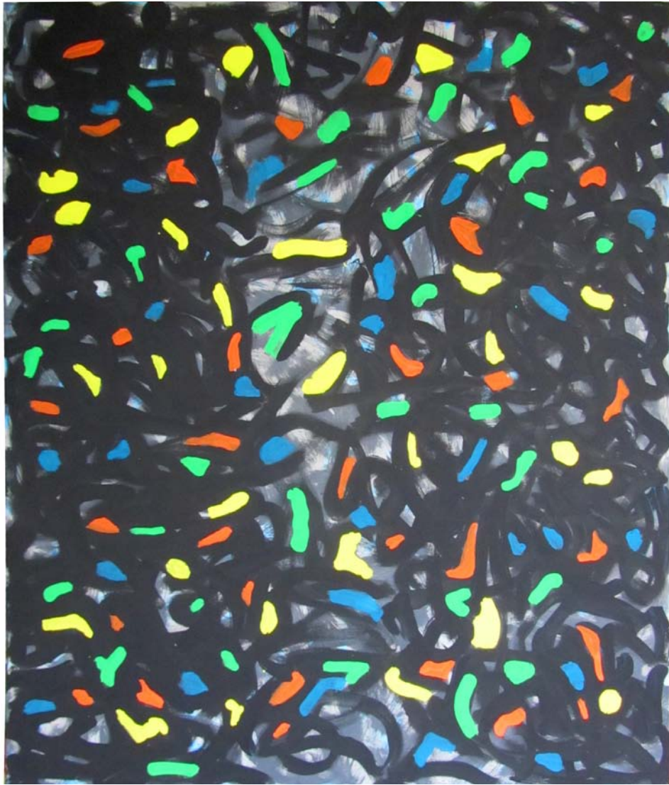
Paris at Night 2017 72" x 60" Acrylic on Canvas