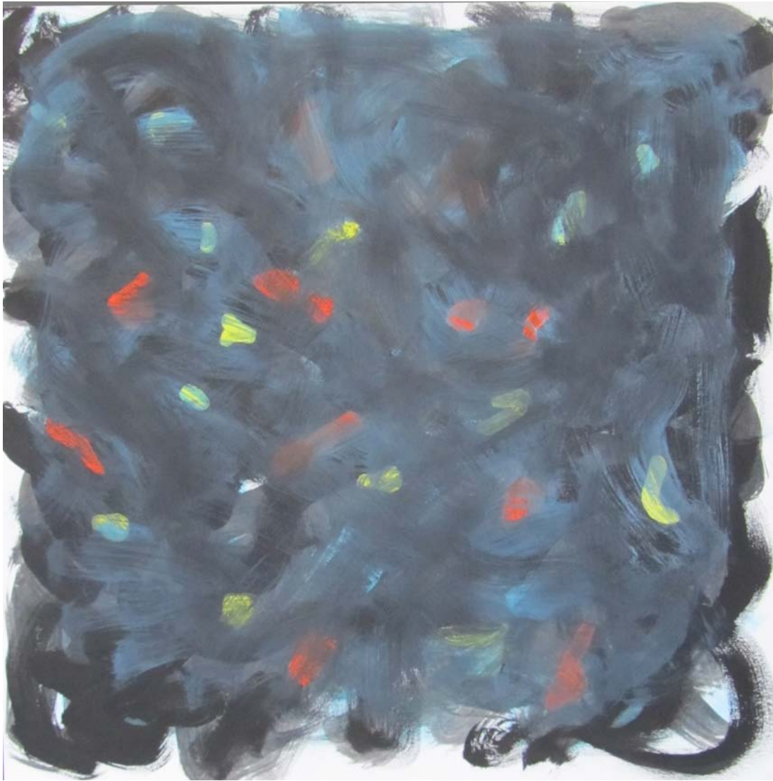
Ocean Mist 2017 36" x 36" Acrylic on Canvas