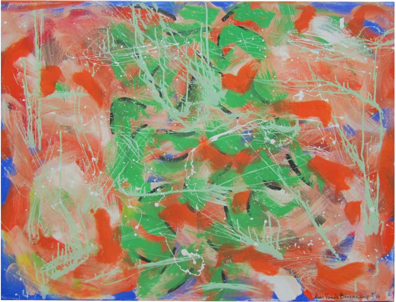
Harvest Pleasure 2017 30" x 40" Acrylic on Canvas