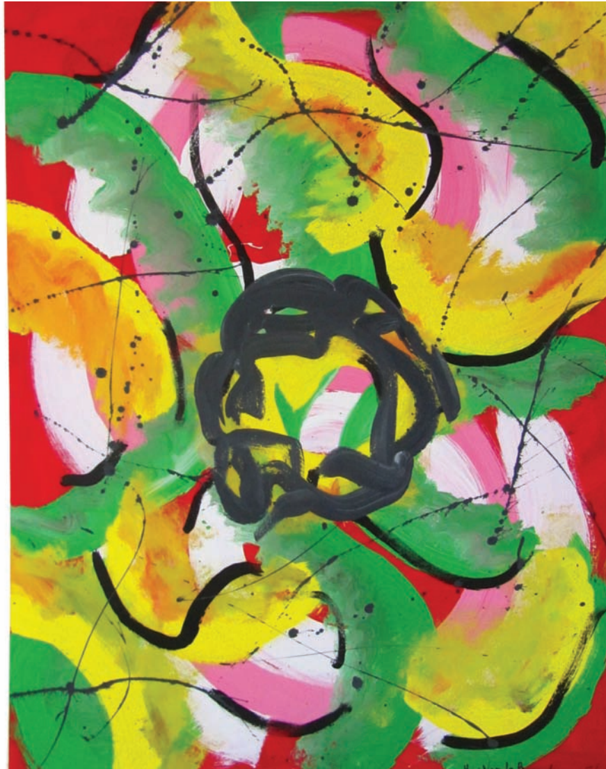
Mint Leaves 2016 40" x 30" Acrylic on Canvas