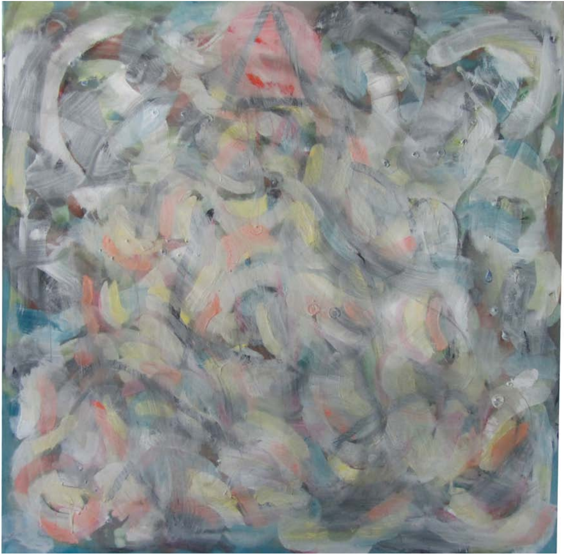
Moonlight Shadow 2016 48" x 48" Acrylic on Canvas