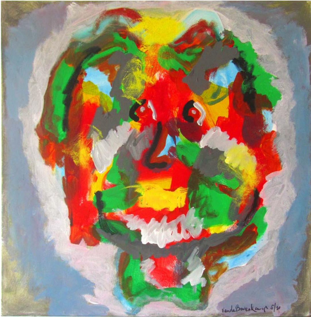
Oscar 2020 24" x 24" Acrylic on Canvas