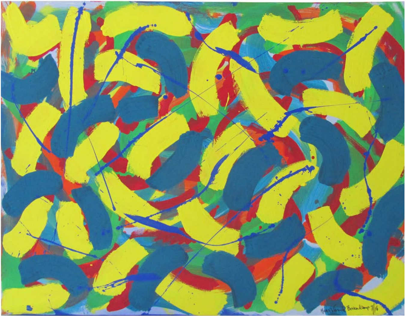
Teal Bananas 2016 30" x 40" Acrylic on Canvas