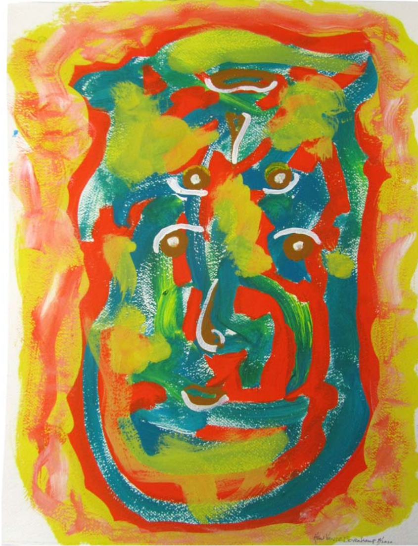
Reflection 2020 30" x 22" Acrylic and Wash on Paper