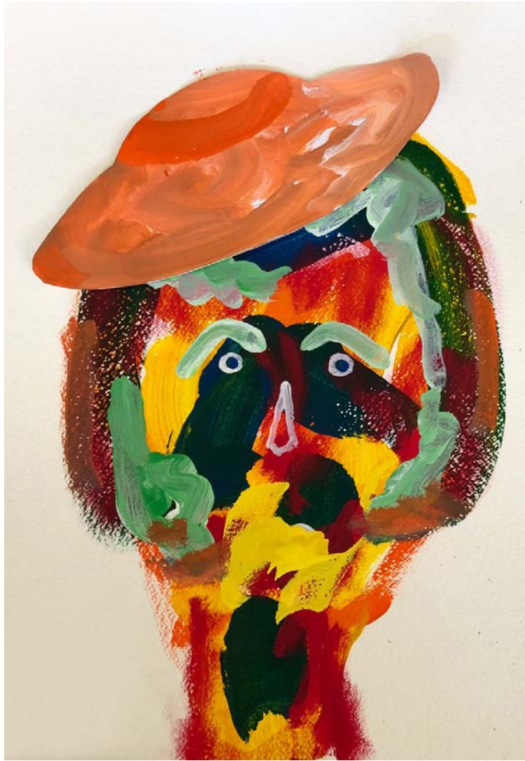
Mrs Chic 2020 36" x 36" Acrylic on Canvas