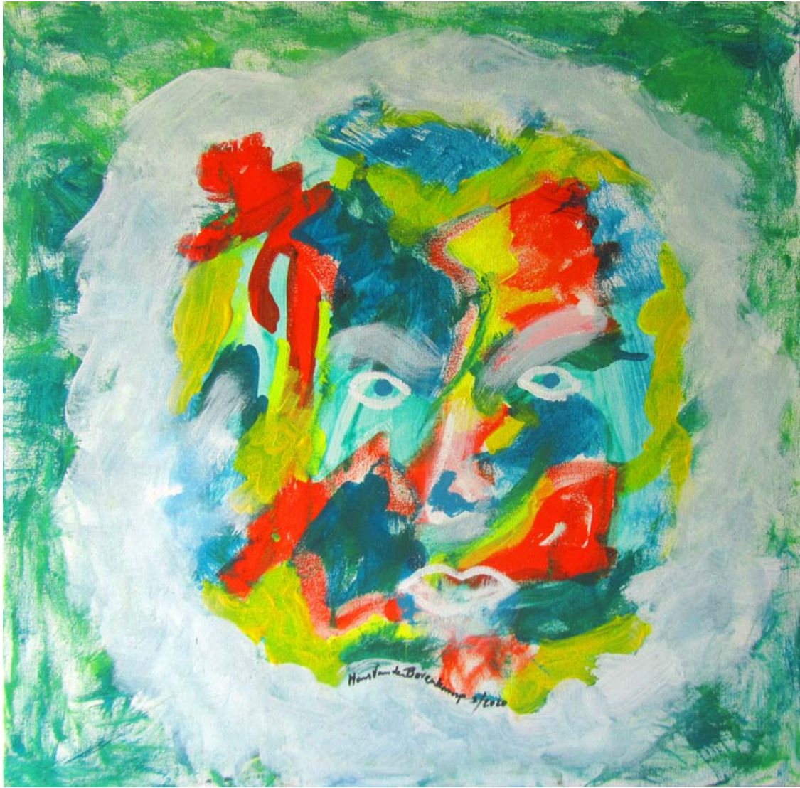
Mr Wizard 2020 24" x 24" Acrylic on Canvas