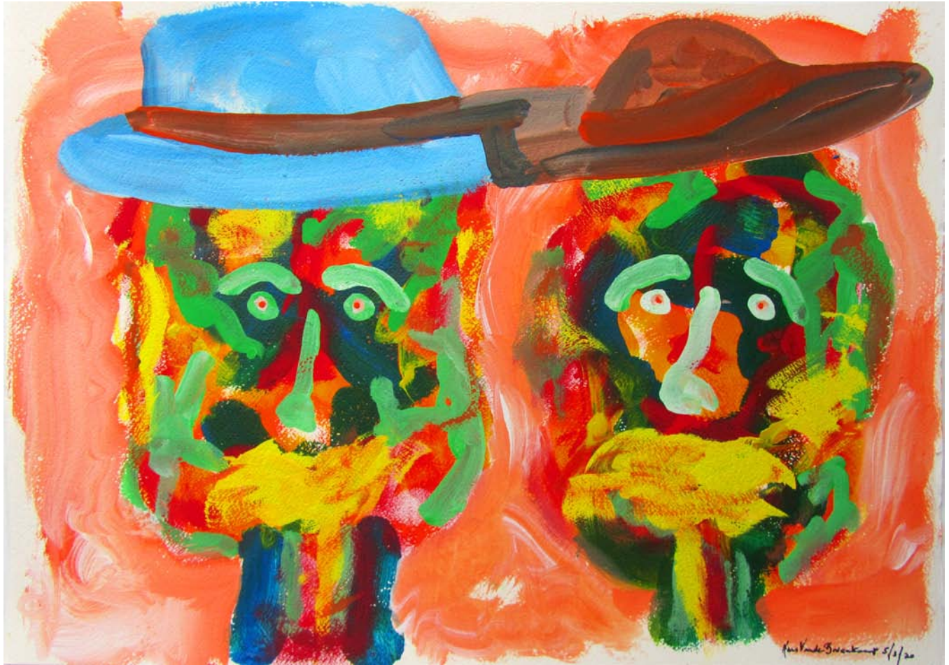
Mr Blue Hat & Mrs Round Head 2020 30" x 22" Acrylic and Wash on Paper