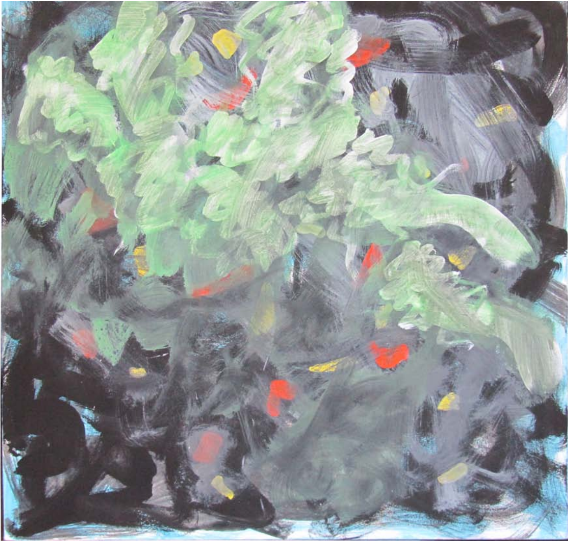
Sagaponack Cloud 2017 36" x 36" Acrylic on Canvas