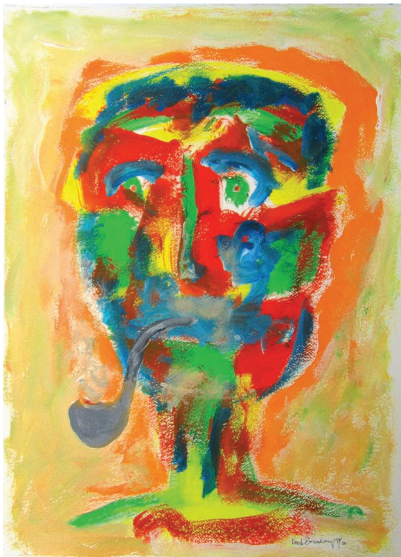
Smokin' Joe 2020 30" x 22" Acrylic and Wash on Paper