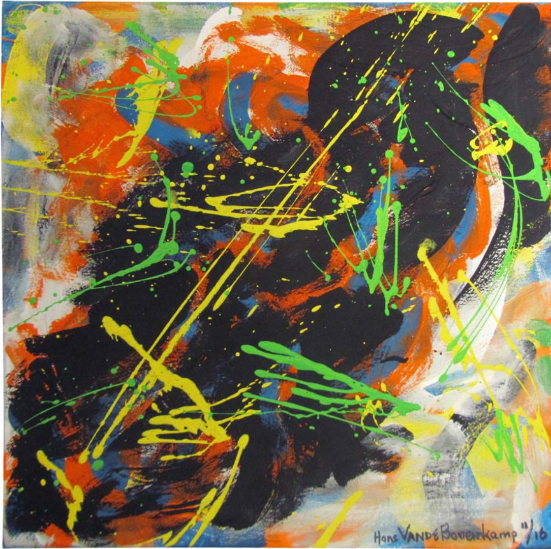
Big Bang 2016 16" x 16" Acrylic on Canvas