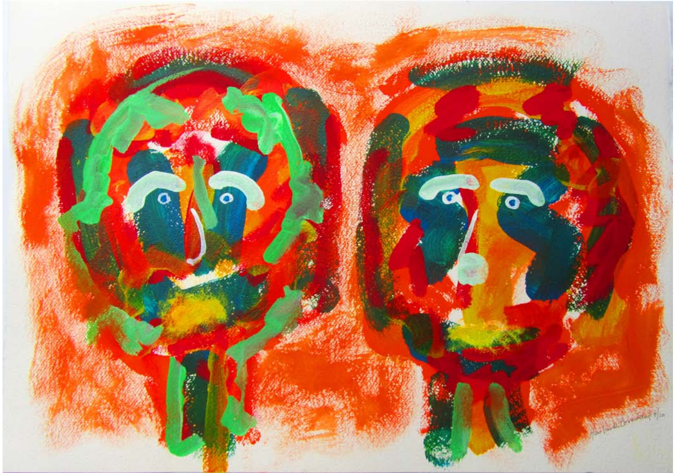
Mickey & Milly 2020 44" x 65" Acrylic on Canvas