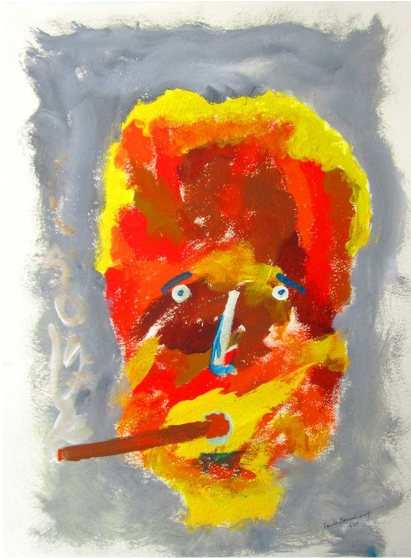
Nathan 2020 30" x 22" Acrylic and Wash on Paper