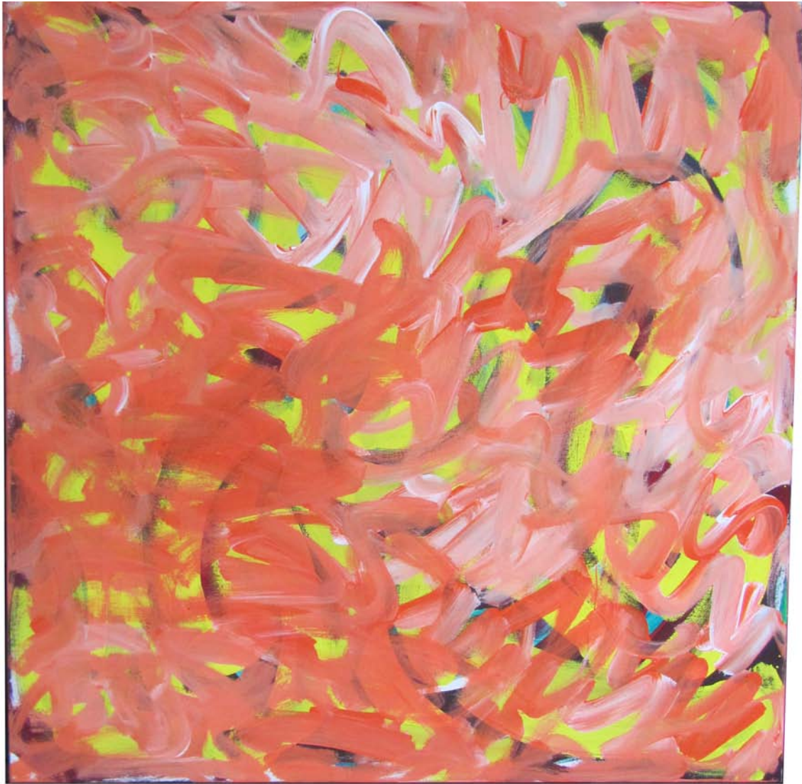
Mango Pineapple 2017 36" x 36" Acrylic on Canvas