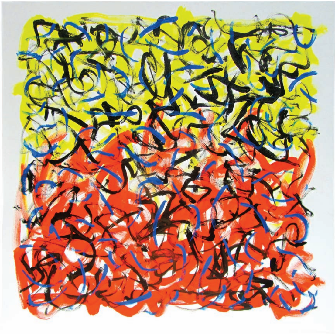
Hidden Messages 2017 36" x 36" Acrylic on Canvas