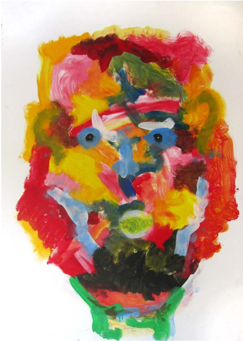
Adam 2020 62" x 43" Acrylic on Panel