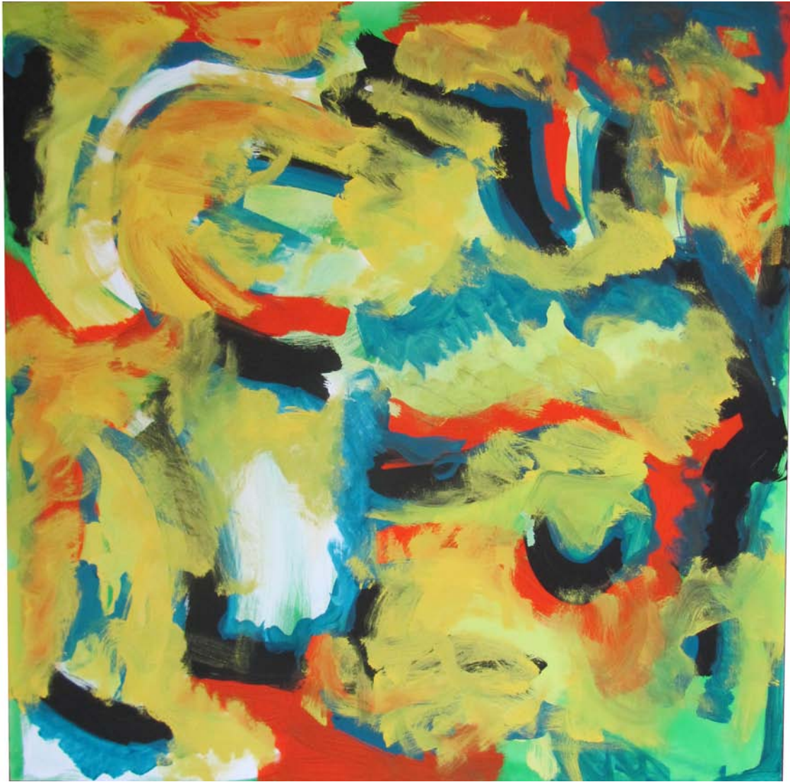
Teal in the Morning 2017 48" x 48" Acrylic on Canvas