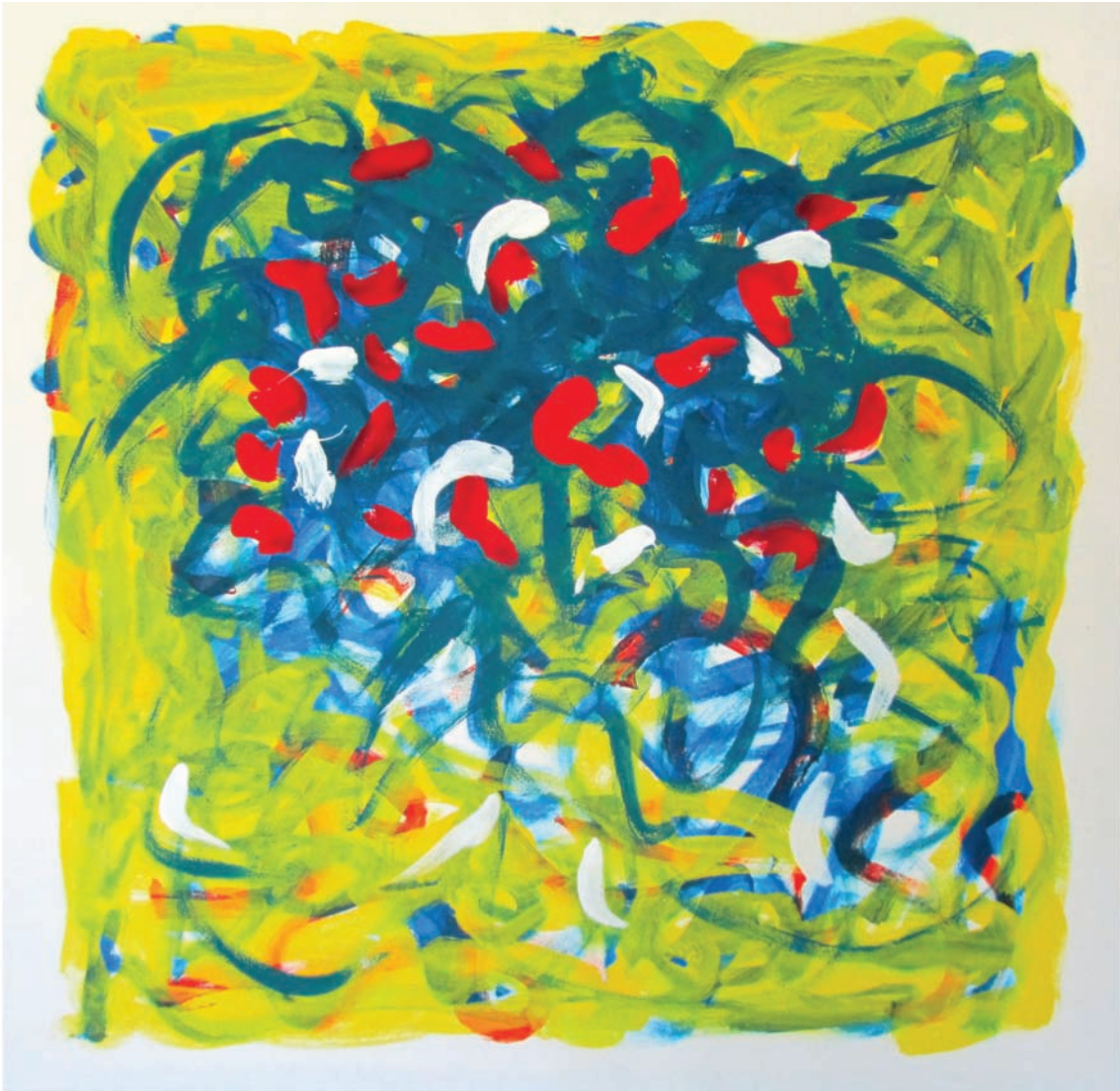
Symphony in Primary Color 2017 36" x 36 " Acrylic on Canvas