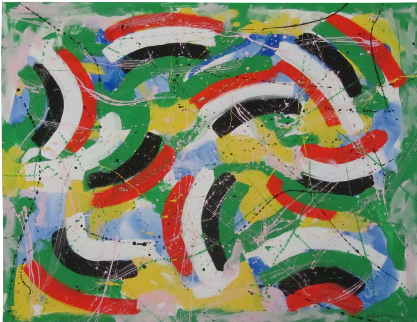
Color Dance 2016 60" x 72" Acrylic on Canvas