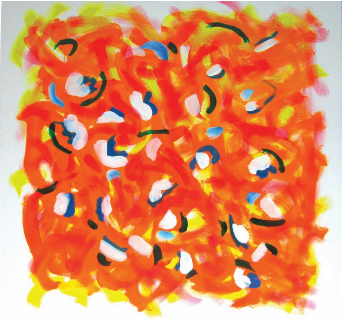
Sunshine 2017 48" x 48" Acrylic on Canvas