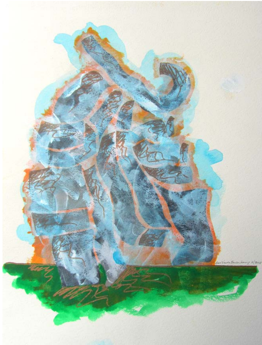
Mountain 2020 30" x 22" Acrylic and Wash on Paper