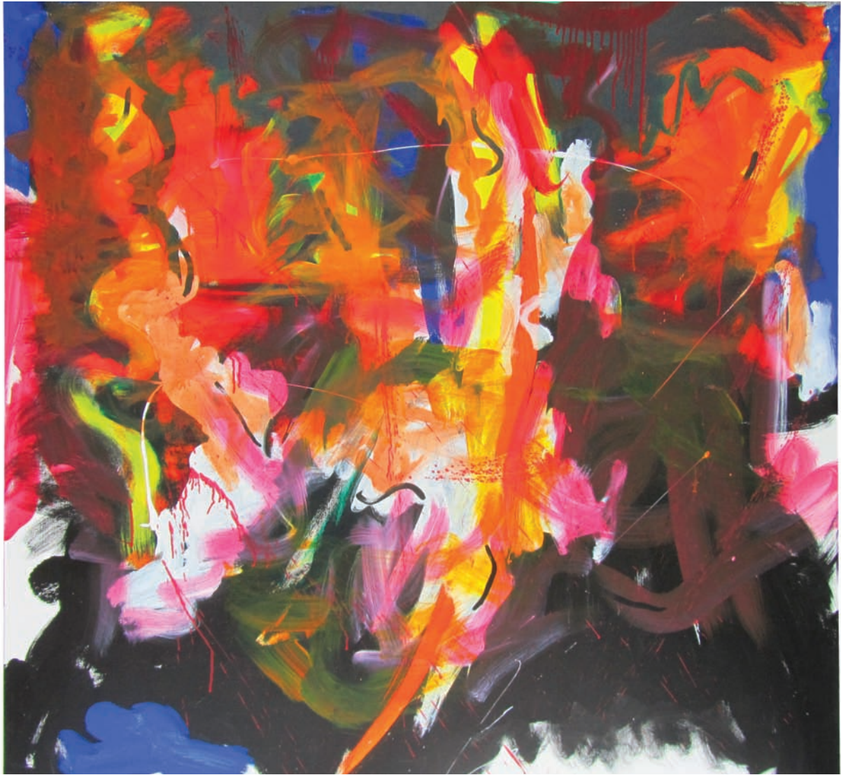
Disco Nights 2017 48" x 48" Acrylic on Canvas