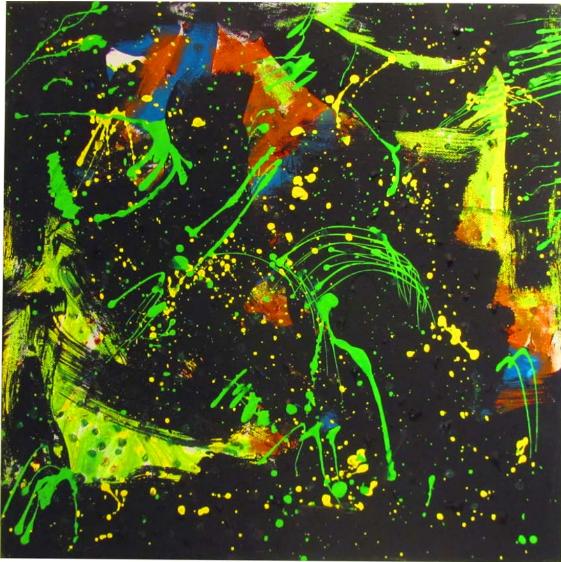
Cosmic Love 2016 16" x 16" Acrylic on Canvas