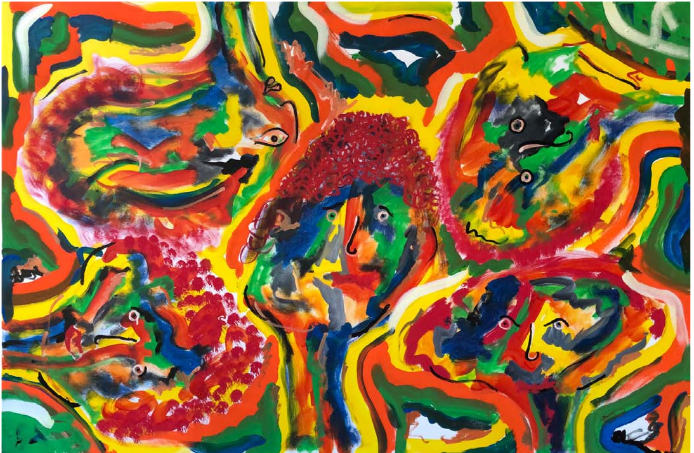
Five of Us 2020 48" x 76" Acrylic on Canvas