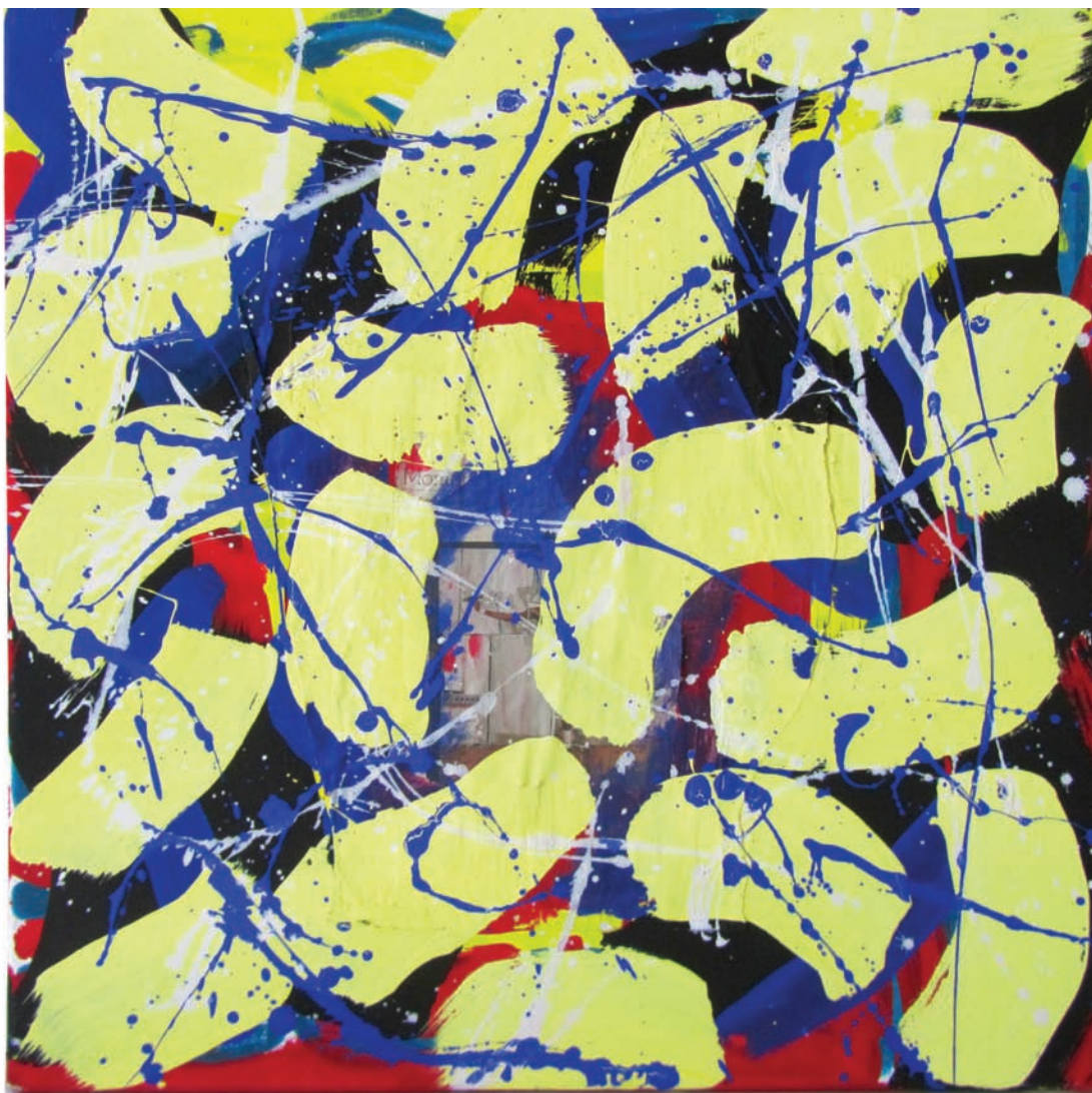
Morning Sun 2016 20" x 20" Acrylic on Canvas