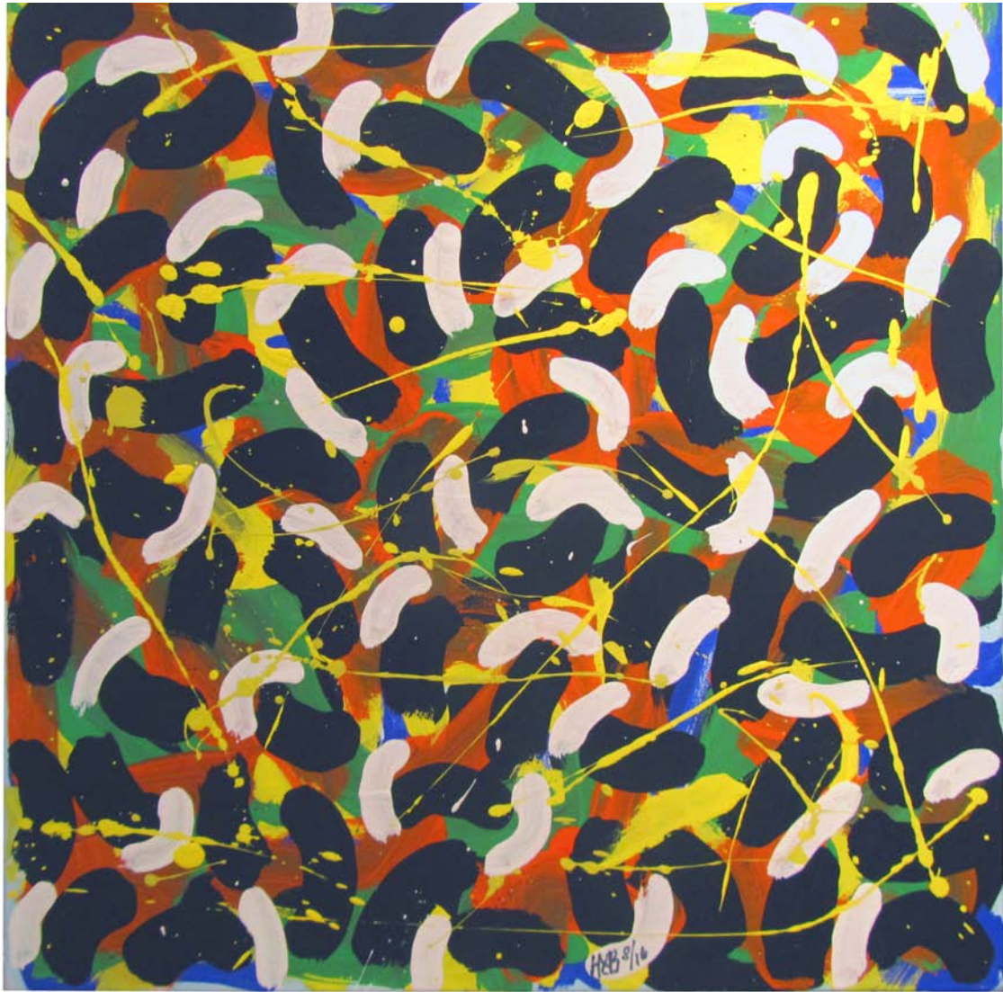
Boogie Woogie Jam 2016 40" x 30" Acrylic on Canvas