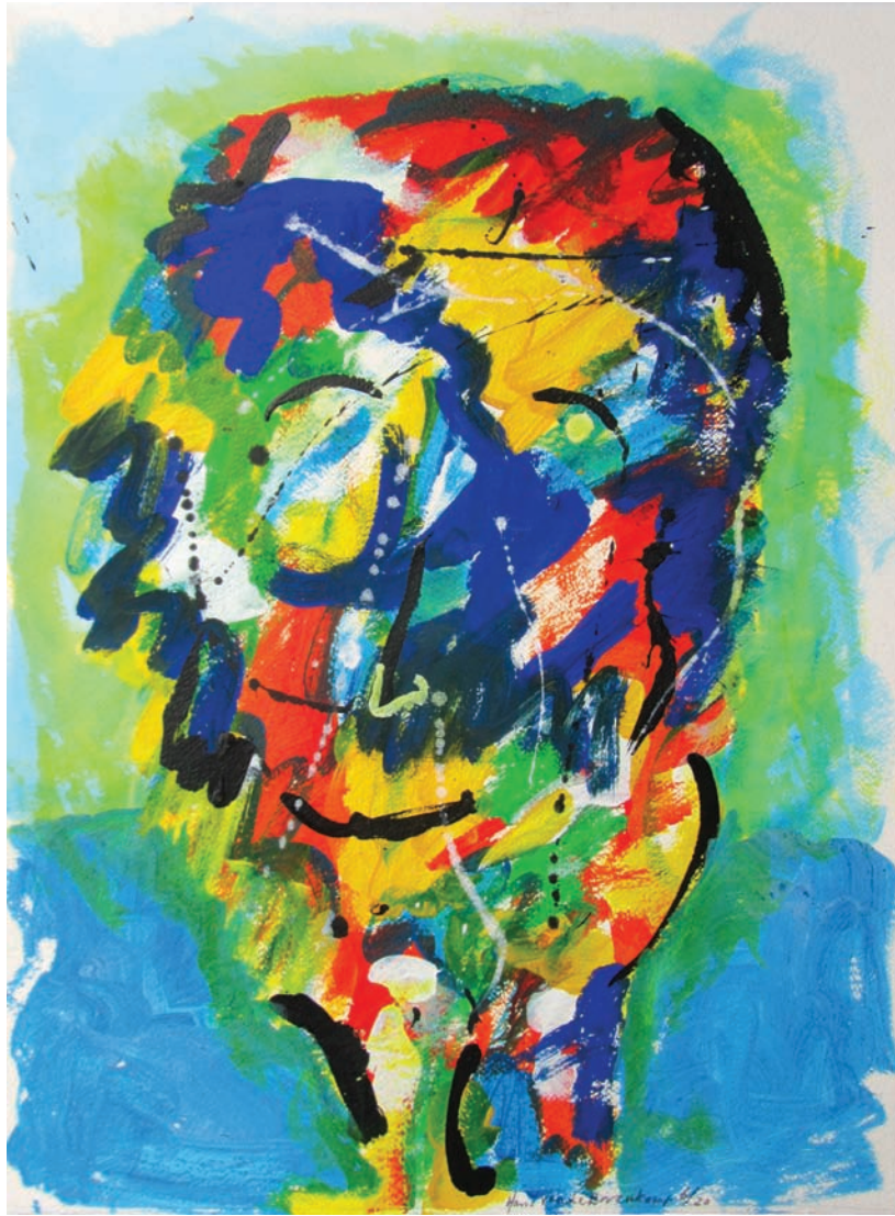
Mr Math 2021 30" x 22" Acrylic and Wash on Paper