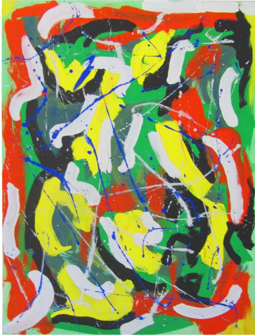
Modern Dance 2016 40" x 30" Acrylic on Canvas