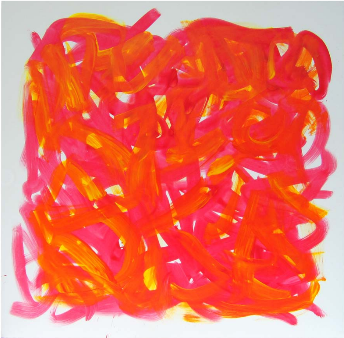
Magenta/Yellow Foxtrot 2017 48" x 48" Acrylic on Canvas