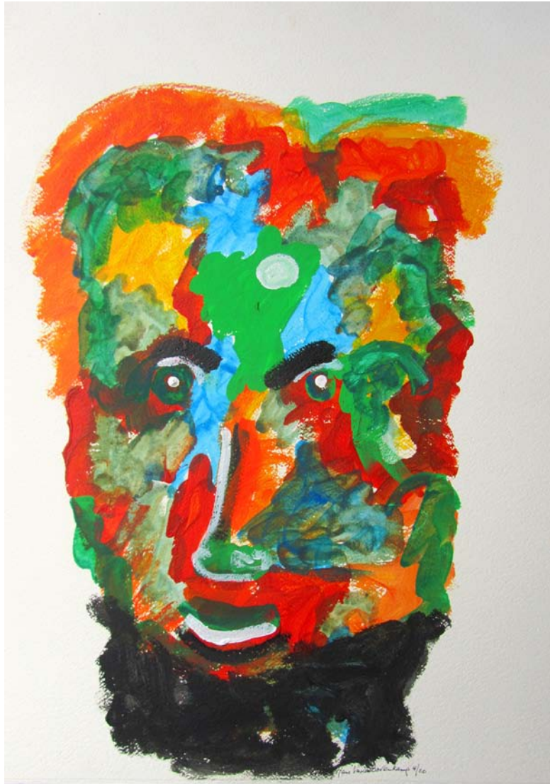
Wolfgang 2020 30" x 22" Acrylic and Wash on Paper